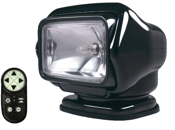
Light Beam Dimensions

PORTABLE MODELS (Magnetic Base) Wireless Hand-Held Remote 30002ST (white) 30062ST (chrome) 30512ST (black)