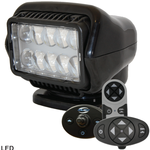
Stryker LED Light Beam Dimensions