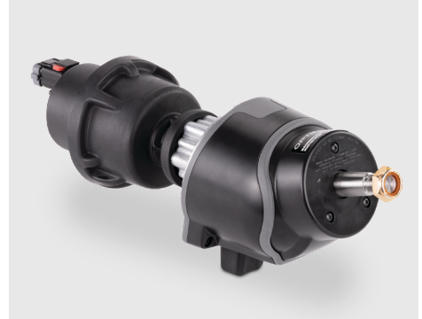
2. Electronic Helms Compatible with the family of Optimus helms which provide auto adjusting wheel turns and effort based on speed