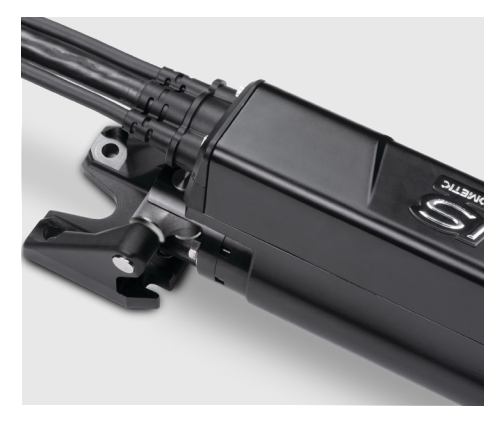
1. Easy Installation Multi-position foot mount design