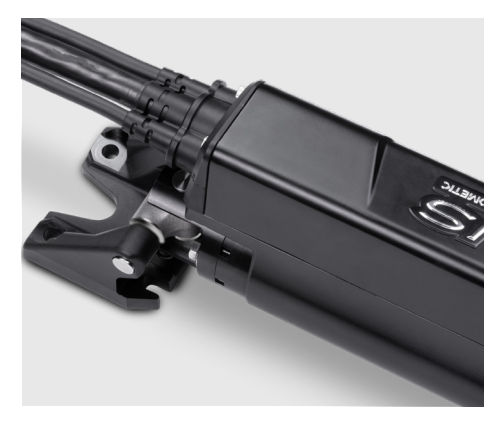
1. Easy Installation Multi-position foot mount design