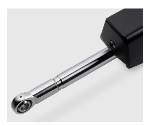
3. Durable Design Leverages the electric actuator DNA for robustness