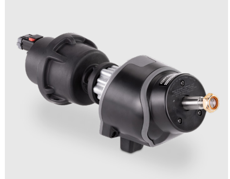
2. Electronic Helms Compatible with the family of Optimus helms which provide auto adjusting wheel turns and effort based on speed