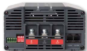
Omnicharge DC connections side